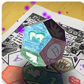
Figure 5. Quivervision Platonic Solids

Based on educational experience, the use of AR technology will be worthwhile to complement our traditional development tools. In addition, it has a significantly positive impact on students' motivation.