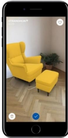
Figure 2. Ikea Place application

The application allows children to arrange a room or apartment of a certain size in real time with real-size elements. This allows them to lay out, for example, a 2-meter by 3-meter room in such a way that includes a bed, table, television, and wardrobe. It also has a development factor of high creativity.