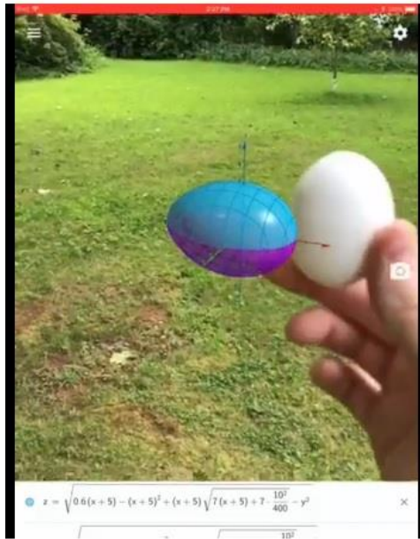
Figure 1. GeoGebra 3D AR

GeoGebra 3D AR's scope is almost limitless at any level of public education. Even in primary school age groups, it is worth improving problem-solving computation through real-life examples: